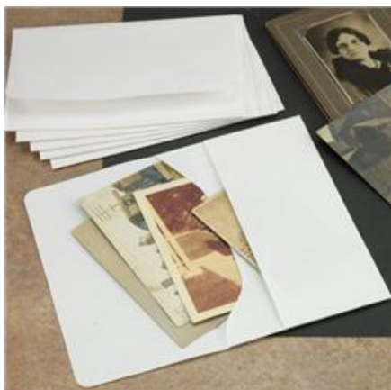
Photo Storage Envelope

Double sleeve allows long term storage. Protects photos and negatives in the same envelope. Top pocket is curve-cut for easy photo access. Bottom pocket is designed to store negatives 7-pt. white unbuffered stock Acid-free, lignin-free P.A.T. Certified 25 envelopes per package; 4 5/8"H x 7 1/4"W