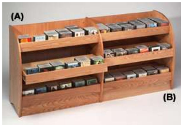
Extra wide 3 tiers CD/DVD Display rack

Model # 11PMT561.3474 Size approx : 45"Hx36"Wx24"D Capacity approx:700 CD/500 DVD (Picture show 2 units)