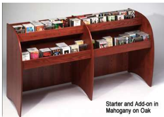
Starter and Add-on in Mahogany on Oak

Model # 11PMT560.2800 Size approx :37"Hx40"Wx24"D Capacity approx: 500 CD/DVD (Picture show 2 units)