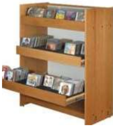
Compact 48”H CD/DVD display rack Model # 11PMTB595.6057000 Size approx : 48”Hx38”Wx20”D Capacity approx: 450 CD