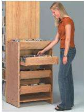
Compact End of Range CD Display rack Model # 11PMTB780.84789 Size approx: 41”Hx25”Wx19”D Capacity approx: 240 CD