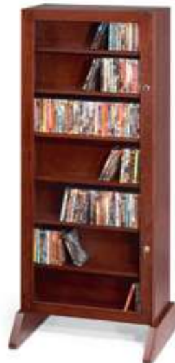
Multimedia security cabinet Model # 11PMT565.2829 Size: 72”Hx25”Wx14”D Capacity: 850 CD/650DVD Swing open glass door w/ lock

If colour not specify, will supply same as picture