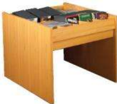
Classic Double face CD/DVD Kiosks

Model # 11PMT561.2827 Size approx: 37"Hx40"Wx24"D Capacity approx: 450 CD/DVD (Picture show 2 units)