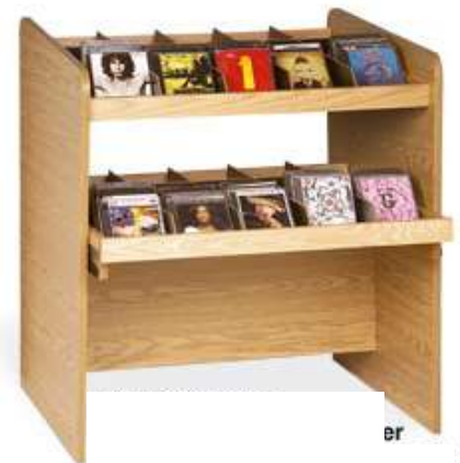
Classic single side CD Flipper Rack- 2 tiers Model # 9PMTB682.60751S2 Size: 39”Hx38”Wx24”D Capacity: 300 CD