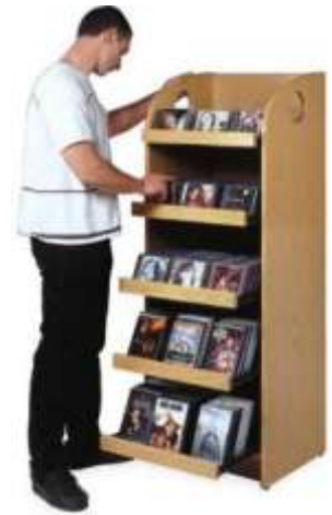
Ovation 60”H End of Range CD/DVD Displayer Model # 11PMTB595.6011600 Size approx :60”Hx20”Wx20”D Capacity approx: 400 CD/ 300 DVD