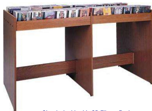
Classic double side CD Flipper Rack

Model # 11PMTB594.60751 Size: 39"Hx38"Wx39"D Capacity: 300 CD (Picture Show 2 units )