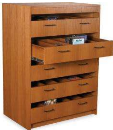
Classic High capacity CD/DVD cabinet

Model# 9PMTB869.60240 Size: 33'Hx35"Wx20"D Capacity: 400CD/ 290 DVD