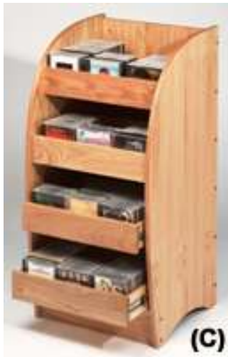
PAL End of Range CD Displayer Model # 11PMT560.2832 Size: 42”Hx21”Wx22”D Capacity approx: 190 CD