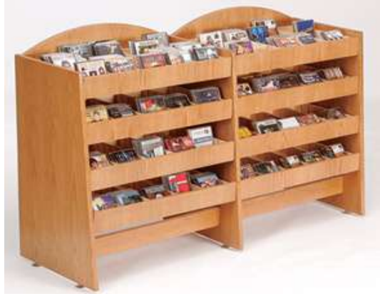
High capacity 4 tiers CD/DVD display rack

Model # 11PMT561.3474 Size approx : 45"Hx36"Wx24"D Capacity approx:700 CD/500 DVD (Picture show 2 units)