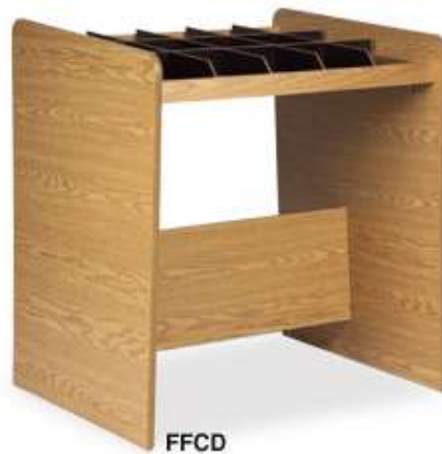
Classic single side CD Flipper Rack- 1 tier Model # 10PMTB598.60751S1 Size: 39”Hx38”Wx24”D Capacity: 150 CD