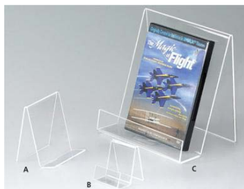
Custom size & design easel