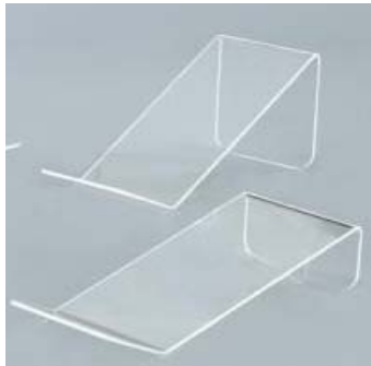
Custom size Angle display easel