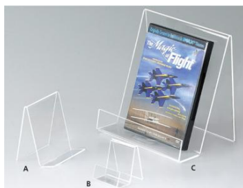
Custom size & design easel