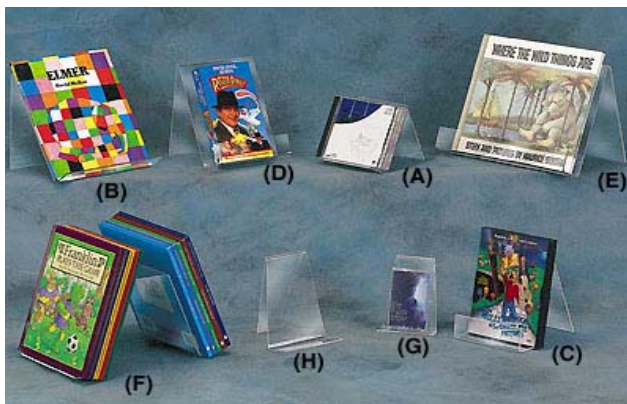
Model H, G, F ,E not available in set