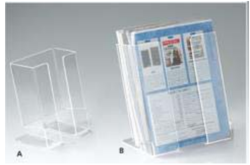
11PMTB247.81655 Single pocket magazine holder 11PMTB247.81654 Single pocket literature holder

Minimum order: 5 units, mix design allow in this page