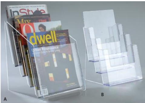
11PMTB249.85886 Multi pocket Magazine holder