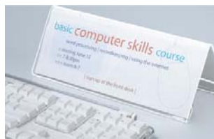
11PMTB242. 87275 Table Top A Frame sign

11P356.1313611 hold 200 bookmark 11P356.1313612 hold 600 bookmark