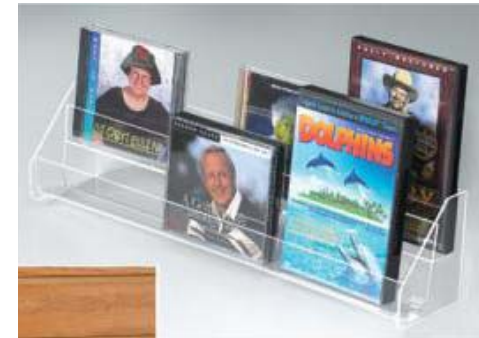
11PMTB253.81671 Multi-Tiered Literature/Media Racks

11P531.122.3227 Standard MagBox, 8"Hx9"Wx7"D, MOQ=2 11P531.1223230 Newspaper MagBox, 9"Hx13"Wx7"D