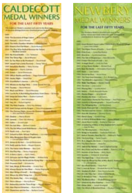
Newbery Bookmarks with Award Winners 200/Pkg 7"H x 3 1/4"W 10P361/131-3026