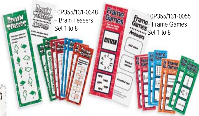
10P355/131-0348 - Brain Teasers Set 1 to 8

Challenge ages 10 to adult with these fun-to-solve visual bookmark puzzles. Puzzles on front, answers on back. Choose from 8 sets of Brain Teasers. Frame Games also offer 8 sets, with 4 levels of difficulty (level 1 being the easiest). (50 ea./4 designs) 200/pkg. -