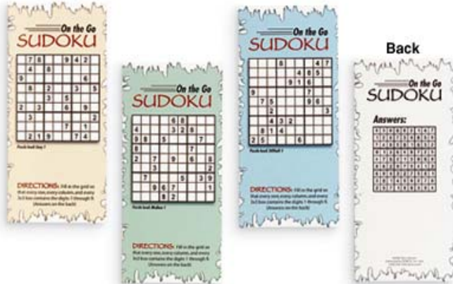
10P3655/131-0596 – Easy Level 10P355/131-0633 – Moderate Level 10P355/131-0648 – Difficult Level