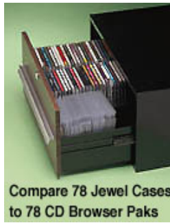
Compare 78 Jewel Cases to 78 CD Browser Paks