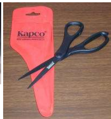
8" Teflon®-Coated Non-Stick Scissors

Average pH 10.5, dissolve in hot water, apply with soft paste cloth, & wipe immediately with dry cloth