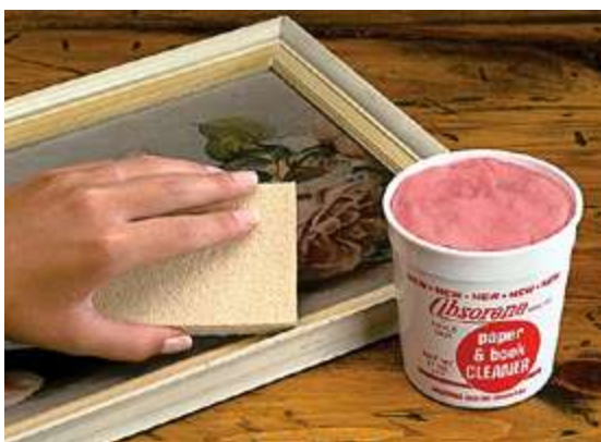
Absorene Cleaner & Dry Cleaning Sponges