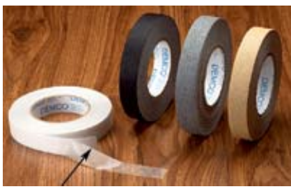
Clear, Black, Gray, Beige