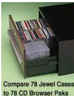
Compare 78 Jewel Cases to 78 CD Browser Paks